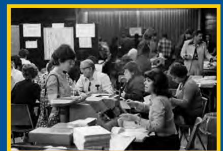
Registering for classes, 1980

Read more about SUNY Schenectady's history and notable alumni by visiting: sunysccc.edu/50-Years