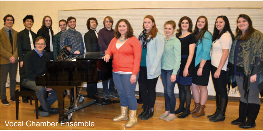
Vocal Chamber Ensemble