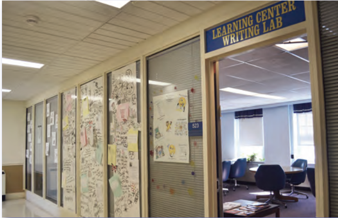
Learning Center (Elston 523): Guidance by professional and peer staff in understanding concepts in subjects such as biology, literature, physics and psychology. Individual sessions in time management, textbook reading and classroom notetaking.

Academic Services offers resources to guide students on their academic journey. For more resources and hours, see last page.